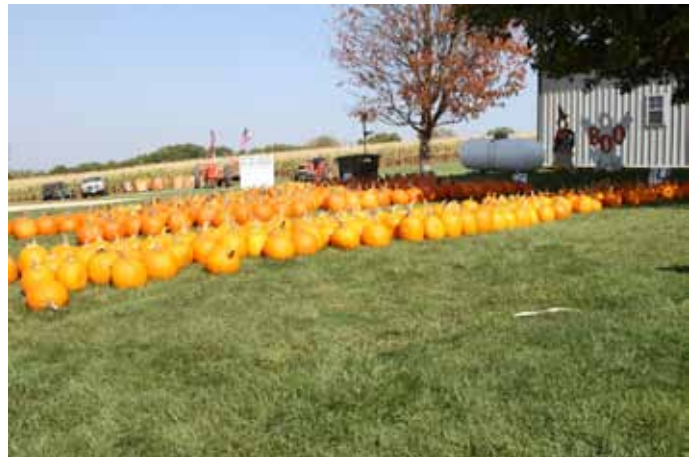
Lots of pumpkins to choose from, pumpkins priced by size.

Schuster's Pumpkin Patch & Corn Maze is open 10am to 5pm on Saturdays and Sundays only beginning September 21 thru October 27 this year. Free parking, free admittance and food options simply add to the attraction. If you want to learn more, check them out on Facebook, visit their website at www.schusterspumpkinpatch.com , or give them a call at 563-556-2879.